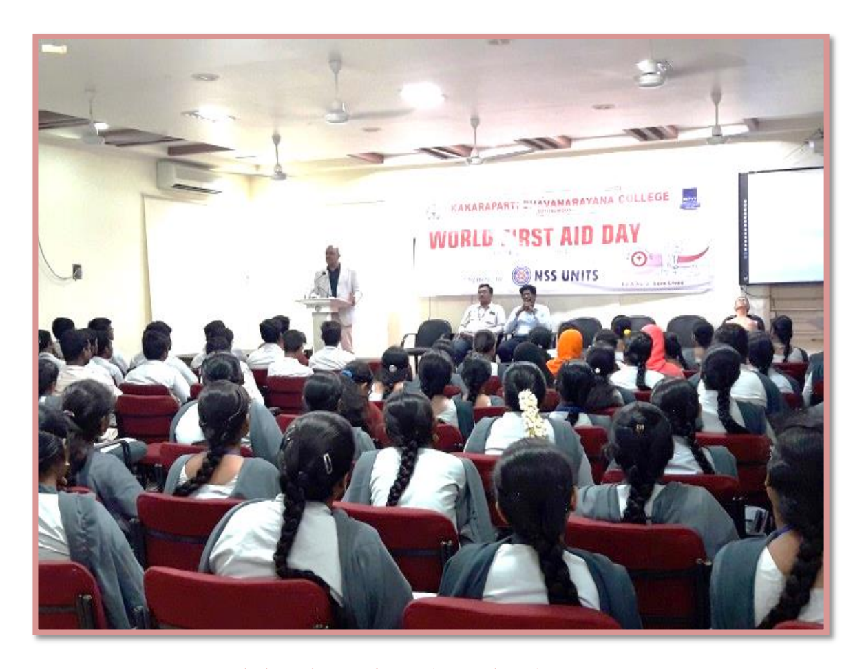
Participation of students in the Programme